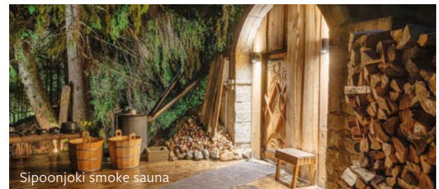
Sipoonjoki smoke sauna